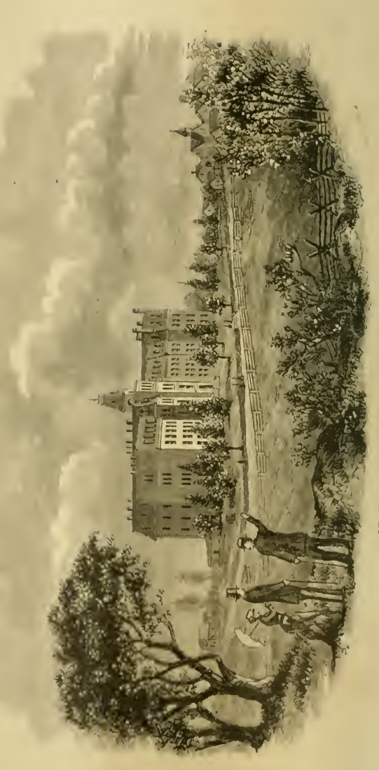
STATE NORMAL SCHOOL, WEST CHESTER, PA.